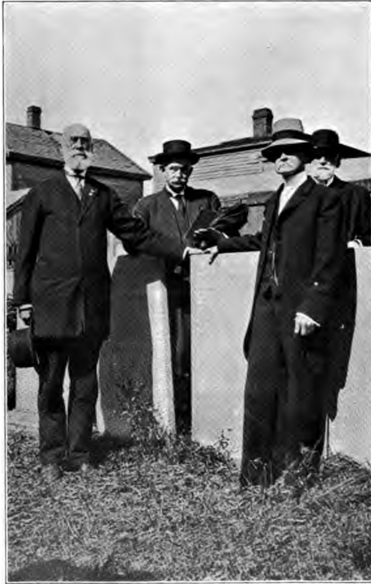
GRAVE OF DR. JOHN CLARKE NEWPORT, R. I.